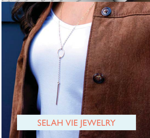
SELAH VIE JEWELRY

Your customer can walk away knowing that their money is helping small business people on multiple levels and that they're coming home with a unique item that was made with love and care.