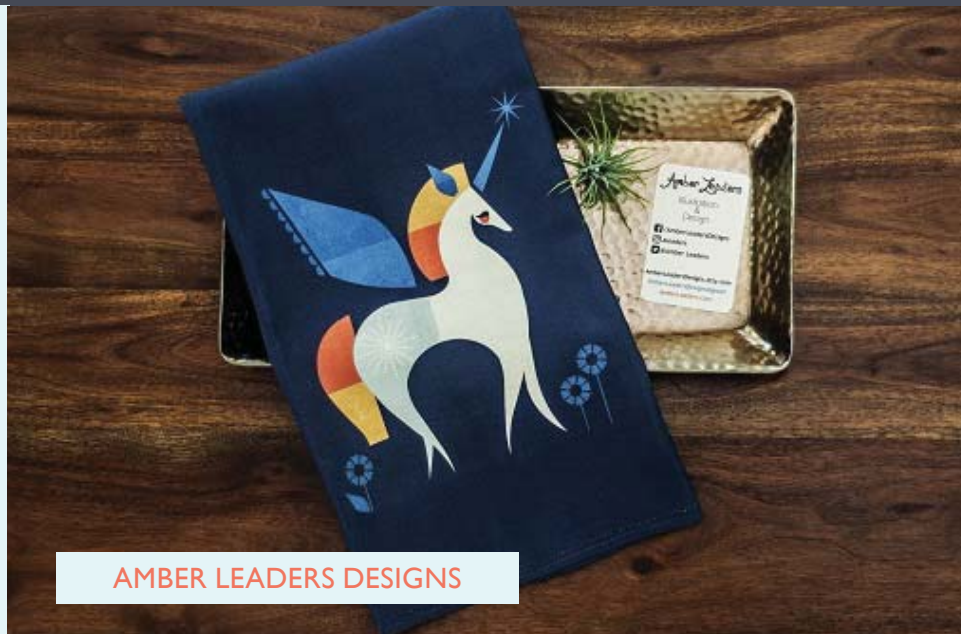
AMBER LEADERS DESIGNS

Visit www.urbancraftuprising.com for more information on each of the companies highlighted.