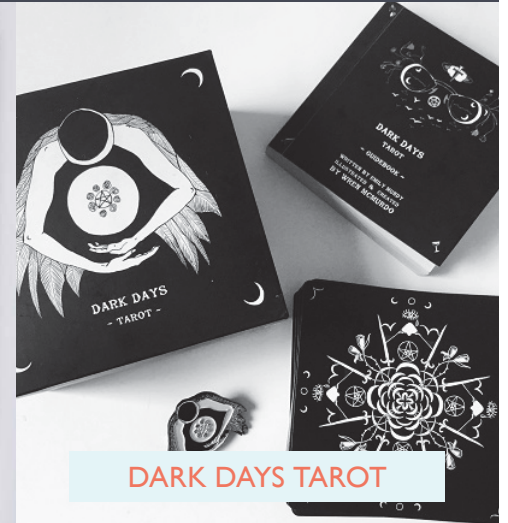
DARK DAYS TAROT